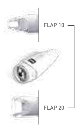
Cellu M6° Integral [2] 🗓